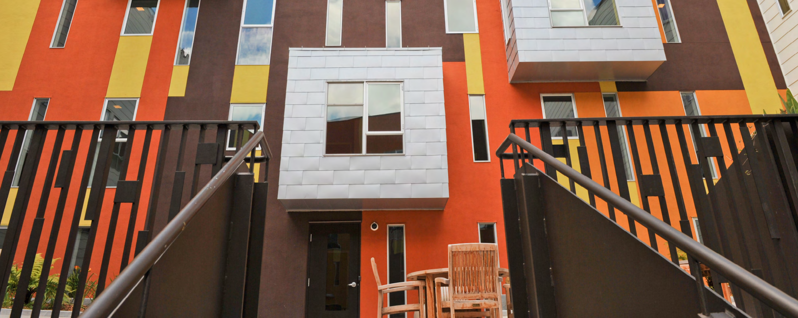
Armstrong Place Senior Housing in San Francisco