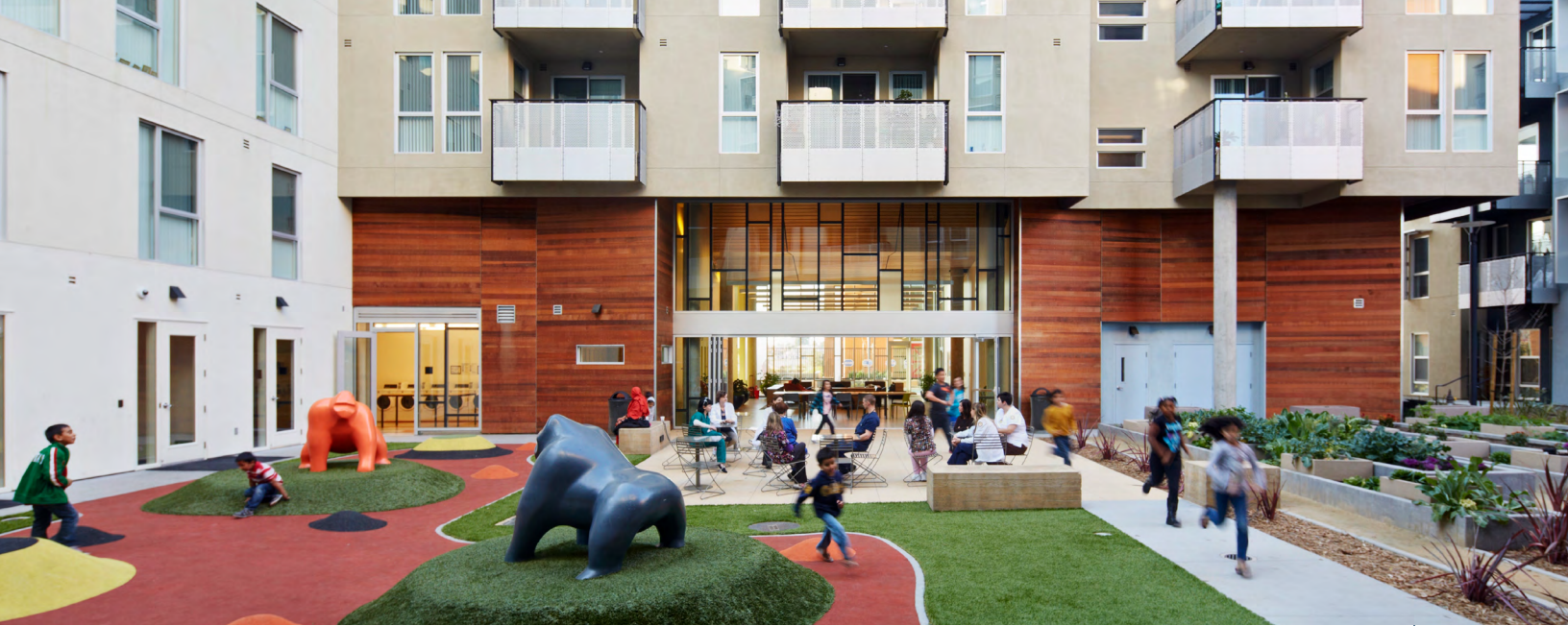
Station Center in Union City