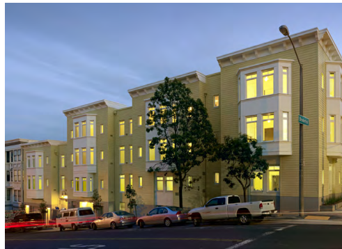
Zygmont Arendt House, San Francisco

AB 1487 requires a minimum of 15% of BAHFA's revenue to be used for preservation programs, which may be appropriate in the near term as the preservation ecosystem matures and develops the capacity to absorb more significant funding. However, in the medium to long term, a greater share may be required to create a transformative impact. BAHFA should actively monitor the demand for and capacity to utilize preservation resources, seek innovative opportunities to support the growth of the preservation ecosystem's capacity, and when appropriate, seek to create a greater balance in funding allocated to each of the 3Ps.