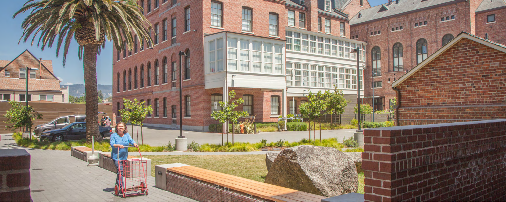
St. Joseph's Senior Center in Oakland