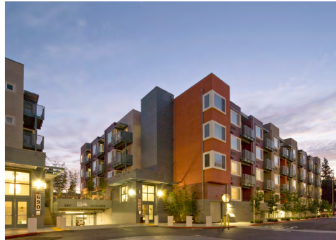
Fair Oaks Plaza in Sunnyvale

Growing unaffordability, compounded by the lasting impacts of the Covid-19 pandemic, has elevated the region's already critical need for protection programs. AB 1487 revenue requirements specify that protection funding must account for, at minimum, 5% of BAHFA's revenue spending. With protection comprising the smallest percentage of BAHFA's funds, securing enough funding to match the need is a challenge. This challenge is further complicated by regulations that prohibit the use of certain forms of revenue, including those generated by a general obligation bond, for most types of tenant protections. BAHFA must therefore prioritize strategies and financing products that generate revenue that can be reinvested in its protection programs, while also pursuing funding opportunities for which tenant protections are an eligible expense (e.g., philanthropic donations, state or federal grants, etc.). Additionally, BAHFA should, within the scope of its authority, pursue and support actions that eliminate or mitigate existing constitutional prohibitions on the use of general obligation bonds for tenant protections and related services.