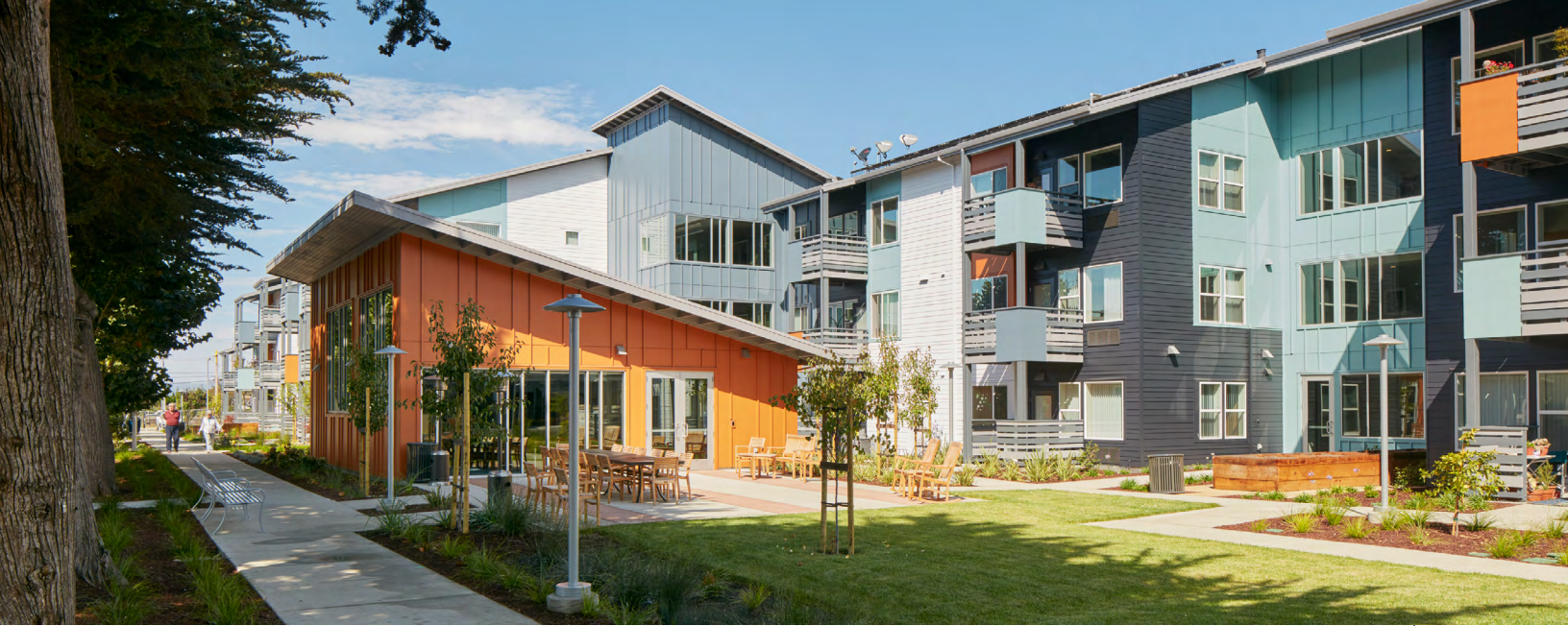
Half Moon Village in Half Moon Bay