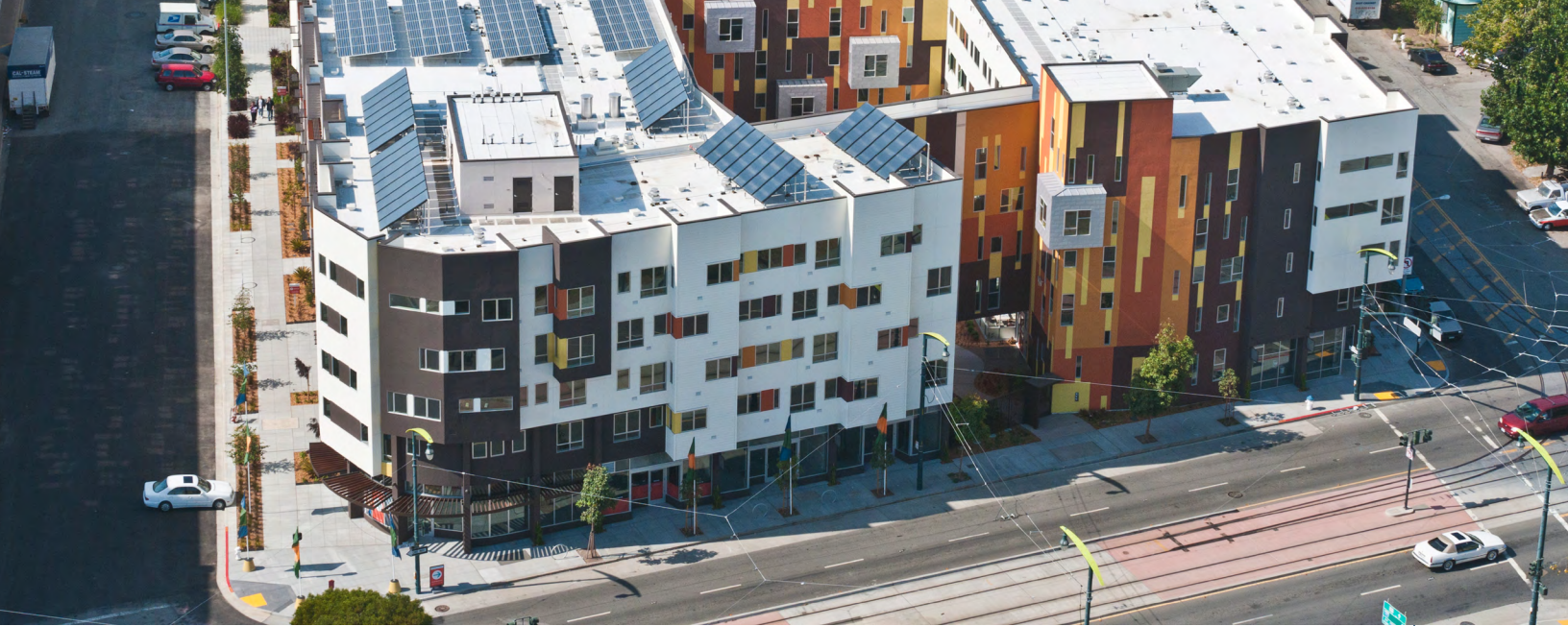
Armstrong Place Senior Housing and Armstrong Townhomes in San Francisco