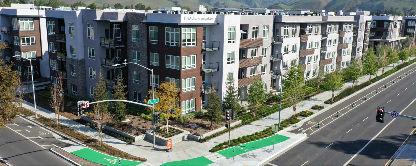
The Asher in Fremont