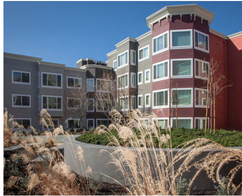
Fell Street Apartments in San Francisco

One potential opportunity for BAHFA to explore is the use of mixed-income housing models, with higher-income units that can cross-subsidize ELI units. Facilitating the creation of integrated, mixed-income housing for people with disabilities (rather than segregating ELI and accessible housing in separate buildings) can also be a potential strategy for advancing equal access to choice and opportunity. Another opportunity is to explore partnerships with local housing authorities, which control the most reliable sources of funding for operating subsidies, to coordinate investments. Moreover, BAHFA has the opportunity to serve as a regional leader by promoting evidence-based best practices for supportive services and trauma-informed property management. This can help ensure that residents of BAHFA-funded properties stay successfully housed and avoid retraumatization that comes with evictions or additional periods of homelessness—which can have a particularly detrimental impact on families with children and people with disabilities.