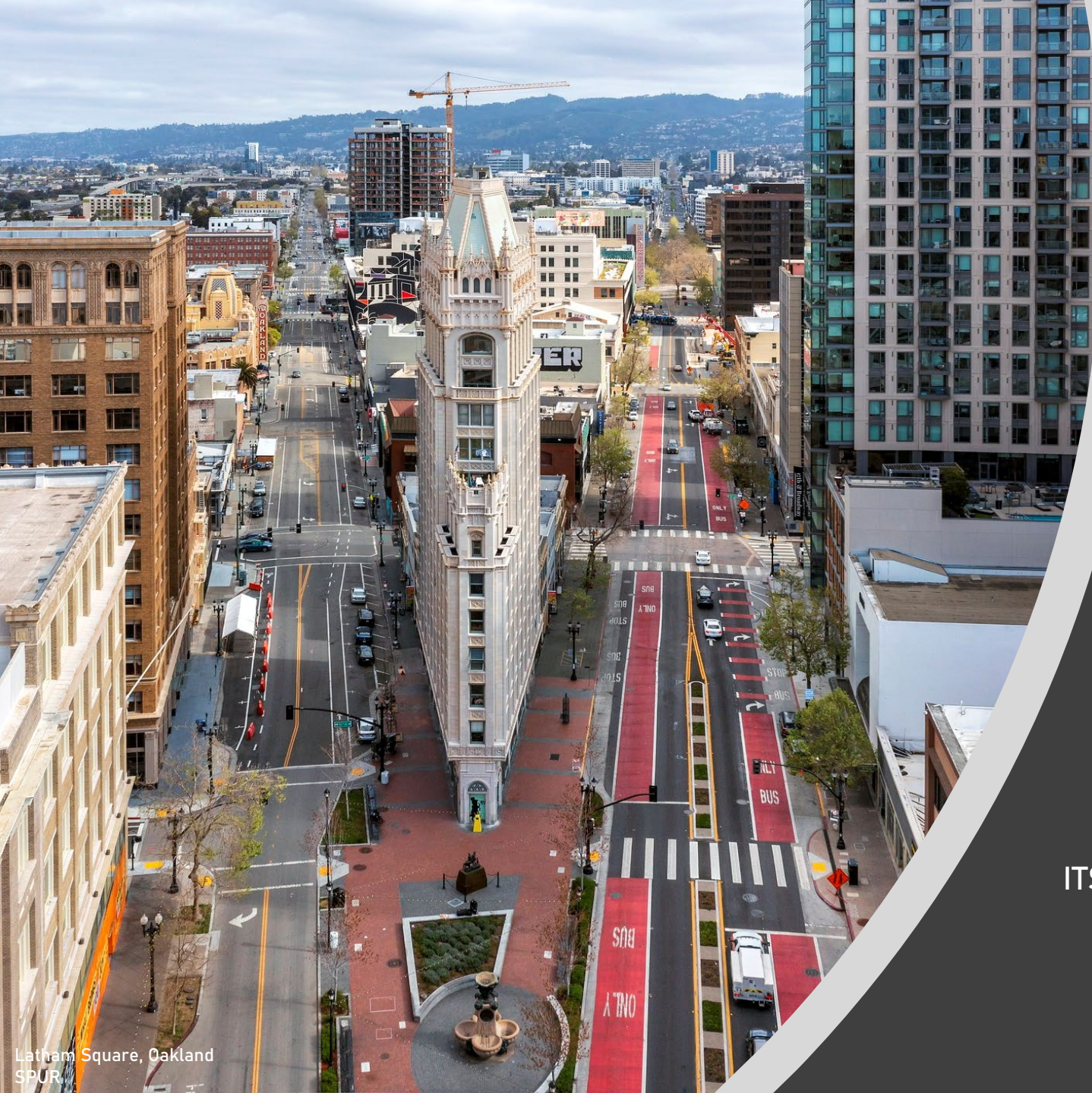
Latham Square, Oakland SPUR