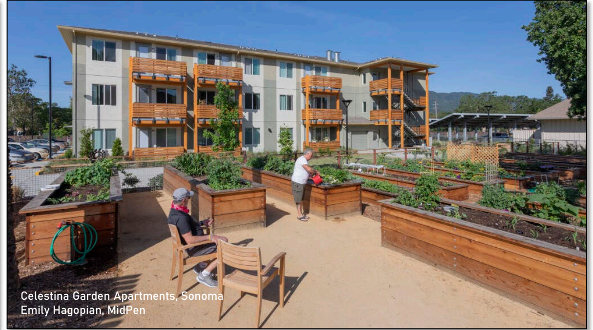
Celestina Garden Apartments, Sonoma, MidPen