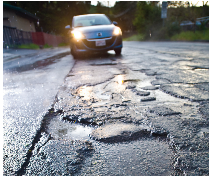
Many Bay Area roads are in urgent need of repair.