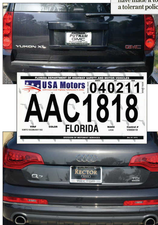
Assembly Bill 516 would establish a mandatory temporary license plate system (Florida example pictured above).

Worse, the problem is gaining momentum, growing 29 percent in the last year alone. MTC is working closely with Assembly Member Mullin's office to ensure AB 516 is heard on the Senate Floor soon and signed by Governor Brown.