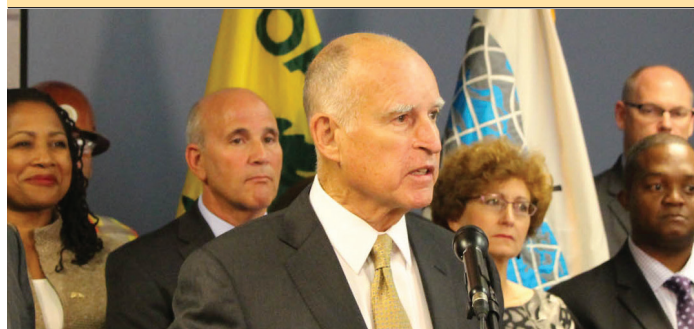
California Governor Jerry Brown announces his transportation funding proposal at a press conference in 2015.

— Governor Edmund G. Brown Jr. 2016 State of the State Address