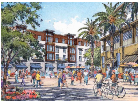
Surrounding neighborhoods, such as the future Bay Meadows Phase II, will connect to the Station Area on new east-west connections