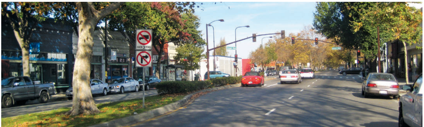
San Pablo Avenue in Berkeley is an example of a 4-lane arterial with a median and street trees that create a pleasant environment for pedestrians and drivers.

Figure 3-3 is a visual simulation of an enhanced El Camino Real corridor at 31 st Avenue, looking north. In the simulation, streetscape improvements and pedestrian-oriented buildings frame a pleasant and vibrant El Camino Real.