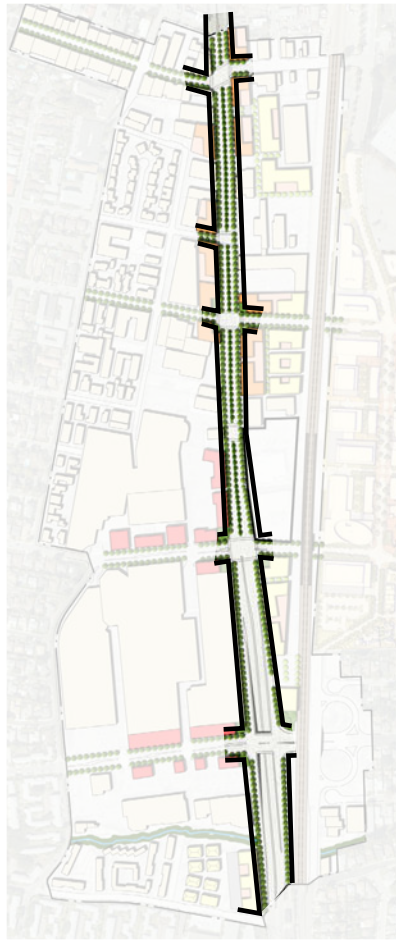
El Camino Real mixed-use corridor, balancing vehicular travel with a pleasant pedestrian environment.