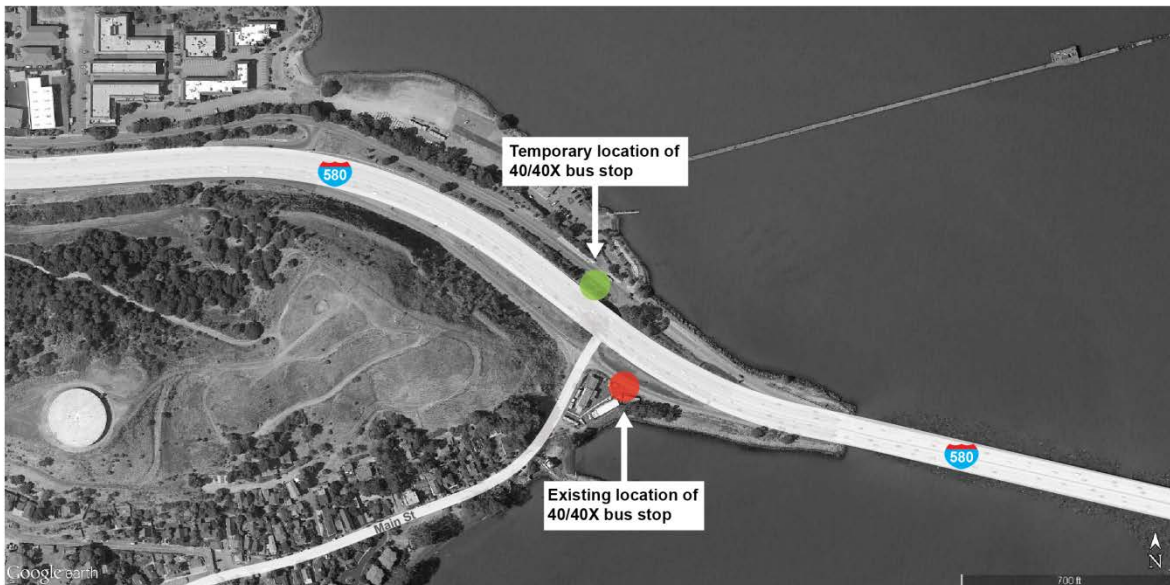
Detour Map 5