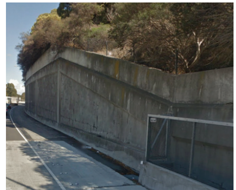
Eastbound I-580 requires widening in Contra Costa County to accommodate the third eastbound lane. The retaining wall shown must be removed and replaced with a wall set further back from I-580.