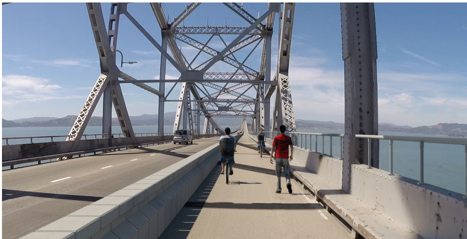
The above rendering shows the proposed 10-foot bi-directional bicycle-pedestrian path on the upper deck of the Richmond-San Rafael Bridge. Path users will be separated from traffic by a concrete barrier system.

For the first time ever the Richmond-San Rafael Bridge will connect the Bay Trail between Contra Costa and Marin counties for bicyclists and pedestrians. Adding another link to the future 500-mile bicycle and hiking network benefits residents in both counties. The proposed path will begin in Richmond at Marine Street and continue adjacent to westbound I-580 to Main Street in San Rafael. A mix of permanent and moveable barriers will separate bicyclists from vehicle traffic.