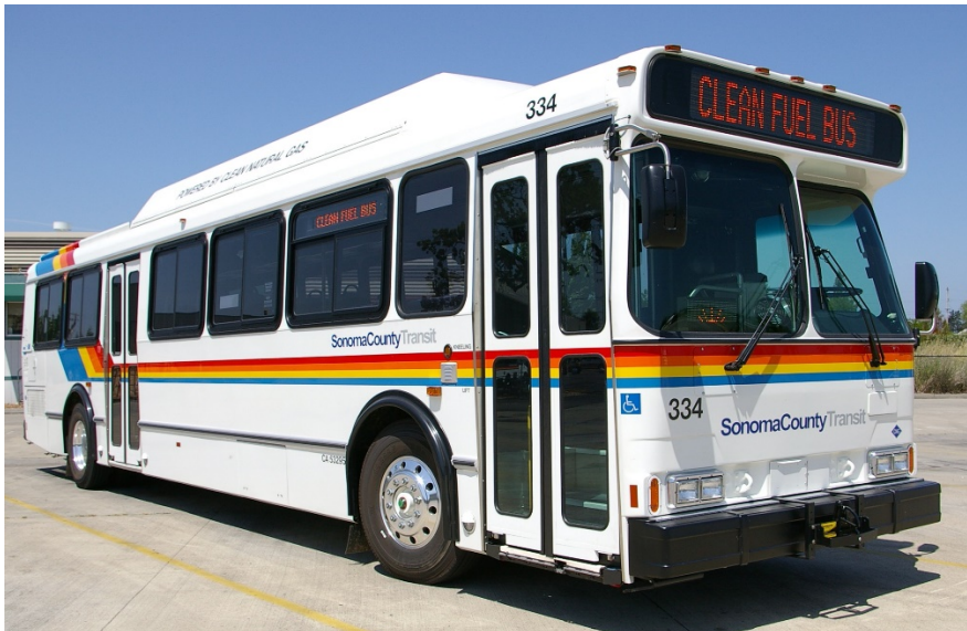
Sonoma County Transit Clean Air Vehicle

Sonoma County currently has four bus transit operators. Sonoma County Transit serves the entire county and Golden Gate Transit serves the 101 Corridor as far north as Santa Rosa. The cities of Petaluma and Santa Rosa have transit systems that serve their respective cities. Sonoma County also shares a rail transit district (SMART) with Marin County that became operational in 2016. The 2019 TIP contains projects that will allow for the installation of a clean natural gas fueling station and purchase clean air vehicles for the transit fleets. Transit facilities including metropolitan transportation hubs and maintenance yards will receive upgrades. Bus stops will be improved in multiple locations. New bus routes will be added and existing routes will be modified to continue to coordinate with SMART service.