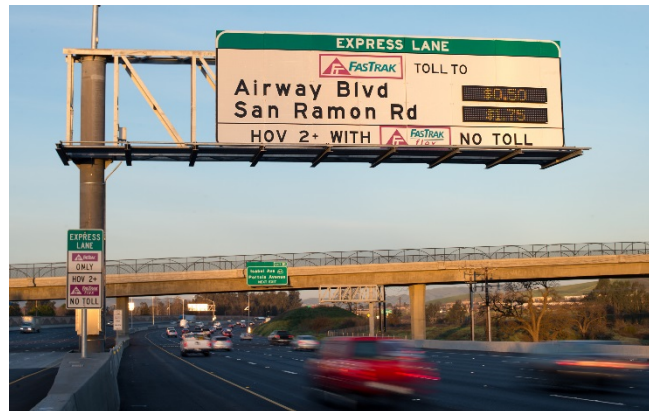
Travelers have made over 14.5 million trips on the I-580 Express Lanes since opening in February 2016.