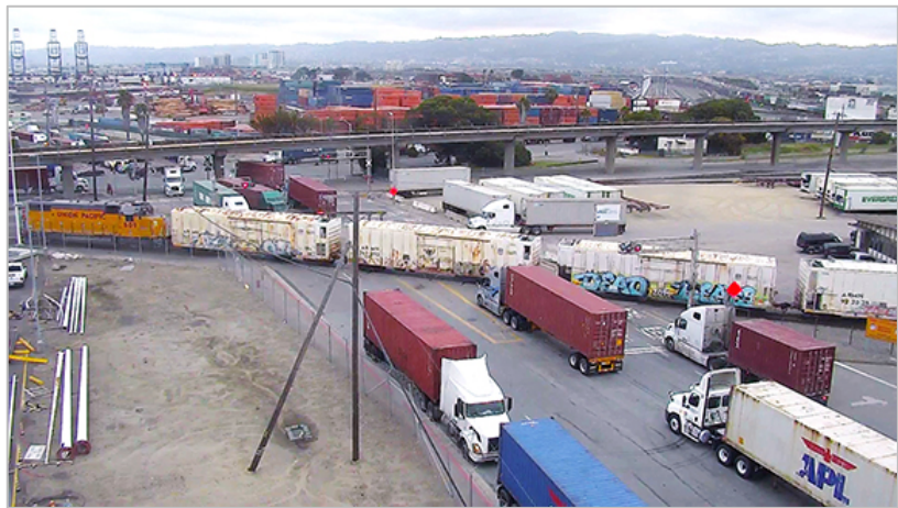
Truck and rail queues at the 7th busiest port in the nation, the Port of Oakland.