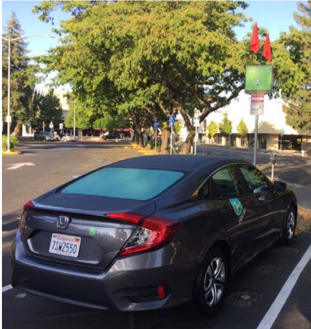
Santa Rosa Zip Car Pilot Program

The SCTA is working on a car share pilot program in Santa Rosa and managing pilot programs to implement other transportation demand management measures.