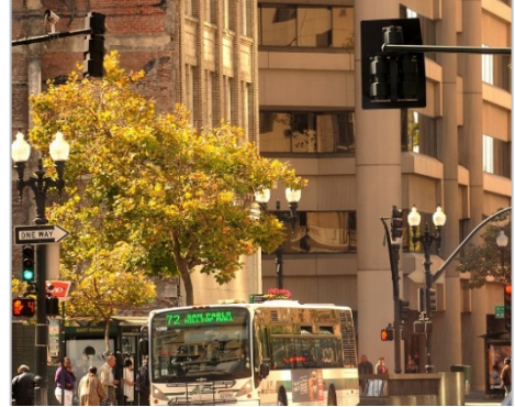
AC Transit picking up passengers on a major arterial.