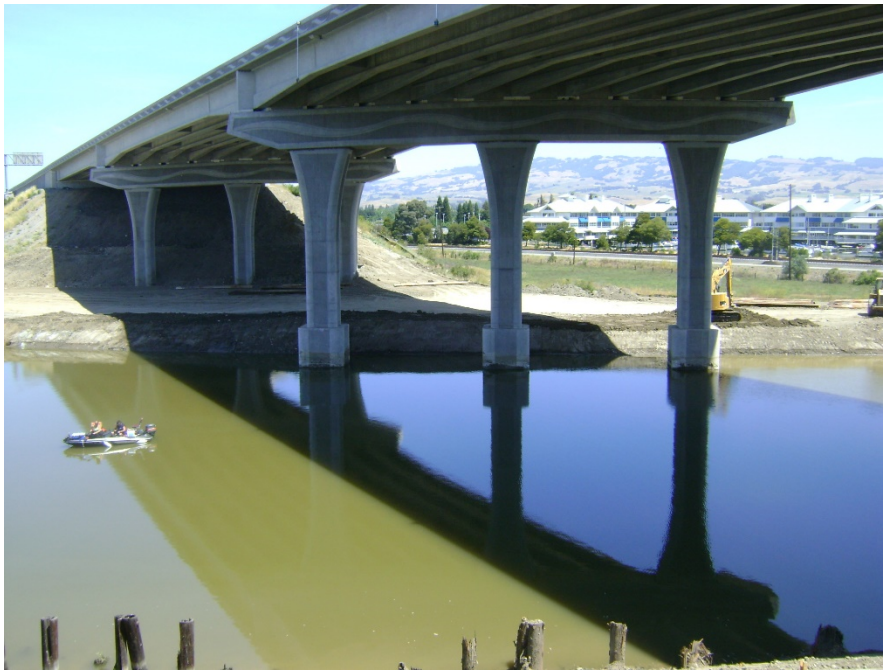
Petaluma River Bridge, US Highway 101 Completed in 2016