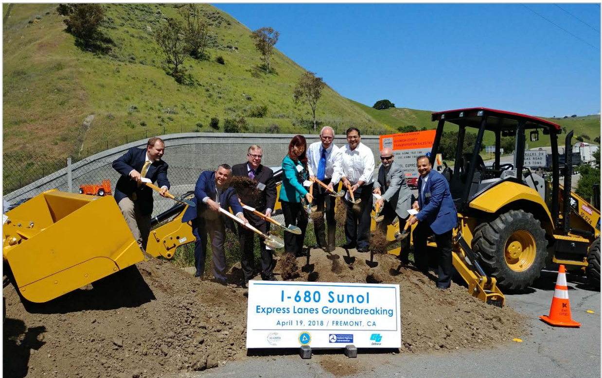
I-680 Sunol Express Lanes groundbreaking for a new northbound 9-mile high-occupancy vehicle/express lane

Highway and major arterial investments are targeted throughout the county to address identified gap closures, operational and safety needs. In the more densely populated northern and central parts of the county, various improvements are identified for the I-80 and I-880 corridors, including the 7th Street Grade Separation project at the Port of Oakland to support improved goods movement in the county and a series of interchange improvements on I-880 at Winton Ave, Industrial Parkway West, and Whipple Road. In eastern Alameda County, highway projects include express lane improvements in the I-680 corridor and improvements to State Route 84. In southern Alameda County, improvements include the State Route 262 cross connector between I-680 and I-880.