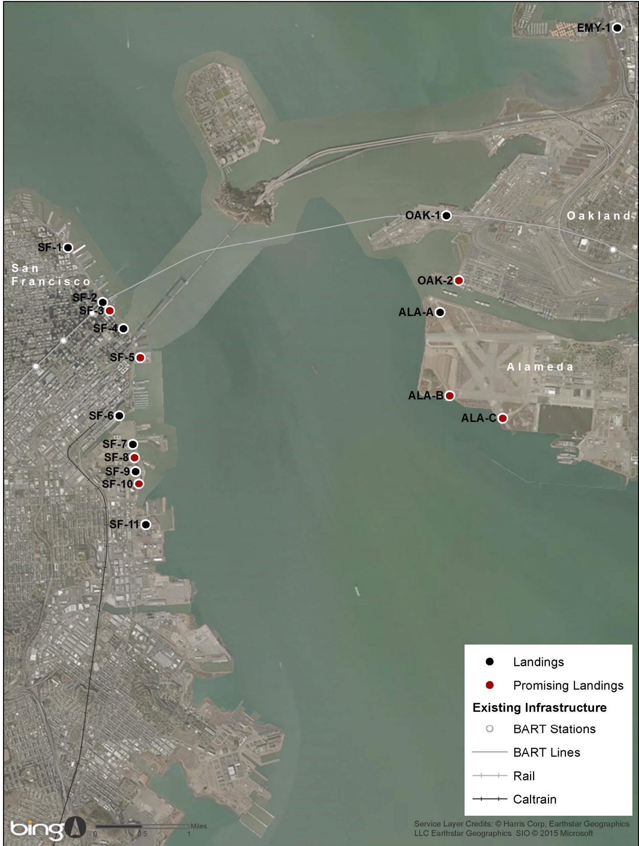
Figure 1. Potential landings considered in San Francisco, Emeryville, Oakland, and Alameda.