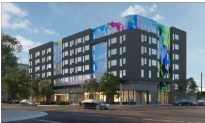
Architectural Rendering of Nellie Hannon Gateway, LPAS Architects

Creating Transformational Change The Pipeline can create efficiencies in the finance system for affordable homes, including providing data for a regional queue for tax credits and bonds. It can help developers and local jurisdictions manage their respective pipelines. For example, San Francisco partners with local non-profits to manage its affordable housing pipeline, which helps developers to know when to apply for local and state funding, often eliminating the need for multiple application rounds. This brings predictability and lowers overall project costs. Pipeline data also can be used to inform funding decisions for transformative new affordable housing and build support for new revenue at the regional, state, and federal levels. This critical funding can unlock the Affordable Housing Pipeline, which will create nearly 26,000 affordable homes that will house over 352,000 individuals and families for decades to come. It also will add to the stock of permanently affordable homes in Bay Area communities, helping to keep the region diverse and affordable over the long term.