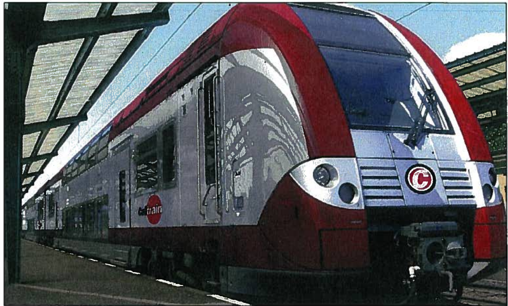
Caltrain EMU Vehicle

** Update/recirculation of the Caltrain Electrification project EA/FEIR.