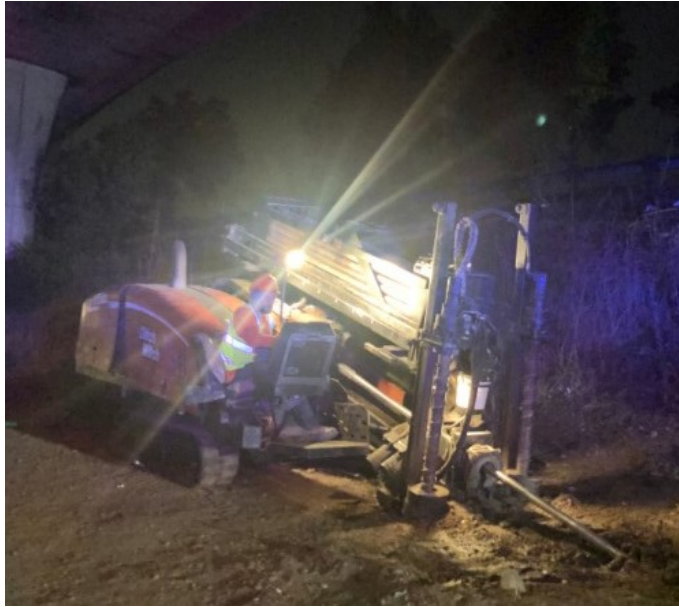
Directional boring for electrical work