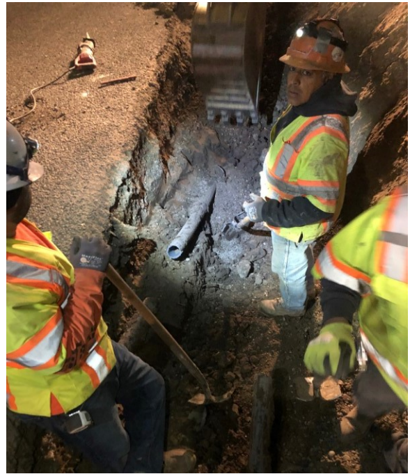
Installation of electrical conduit

If you would like to add people to our email list, or if you experience significant impacts or have questions, please contact us.